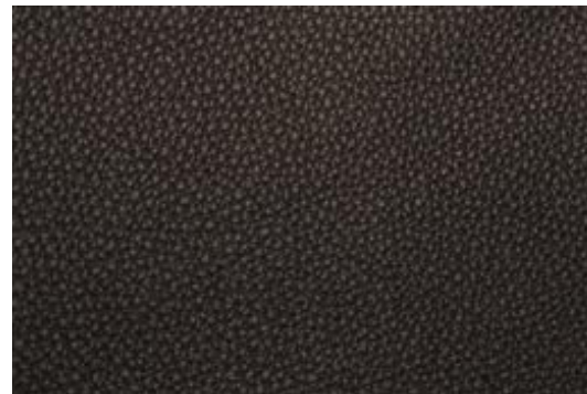
Dark Brown 578