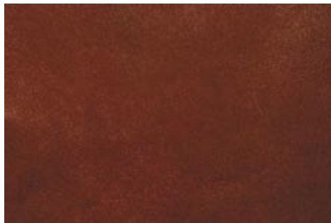
Indian Red 95